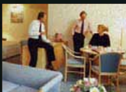
Conventional High-Resolution Camera